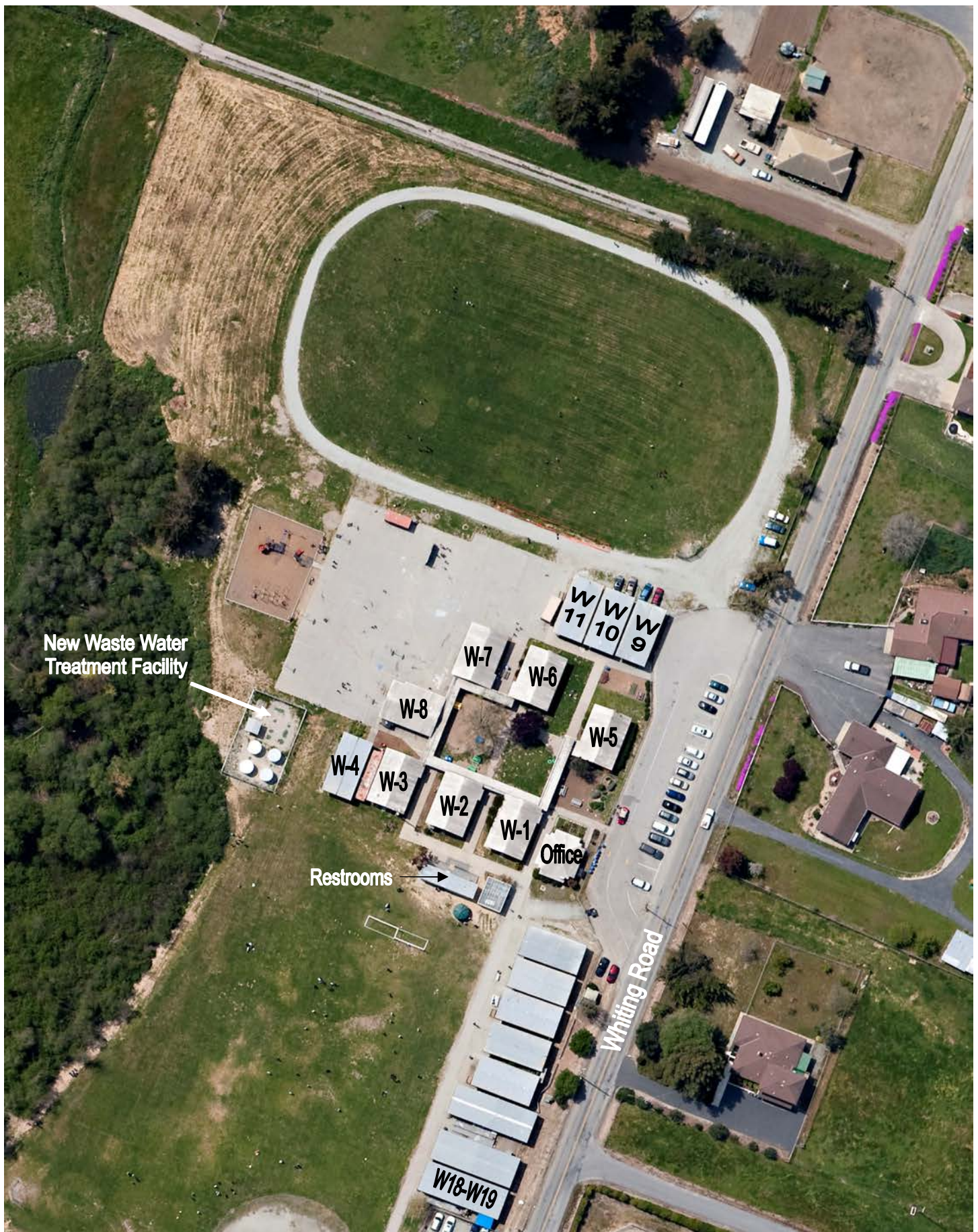
Watsonville Charter School of the Arts 75 Whiting Road, Watsonville, CA 95076 Aerial Photo Taken 4/6/09