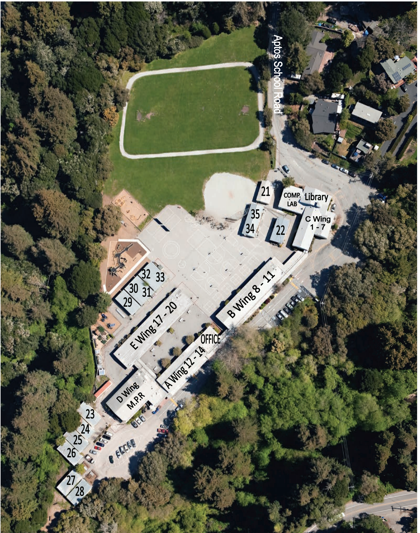
Valencia Elementary School 250 Aptos School Road, Aptos, CA 95003 Aerial Photo Taken 4/6/09