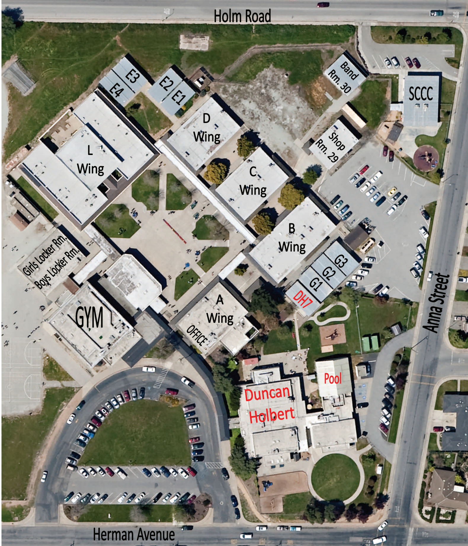
Rolling Hills Middle School 130 Herman Avenue, Watsonville, CA 95076 Aerial Photo Taken 4/6/09