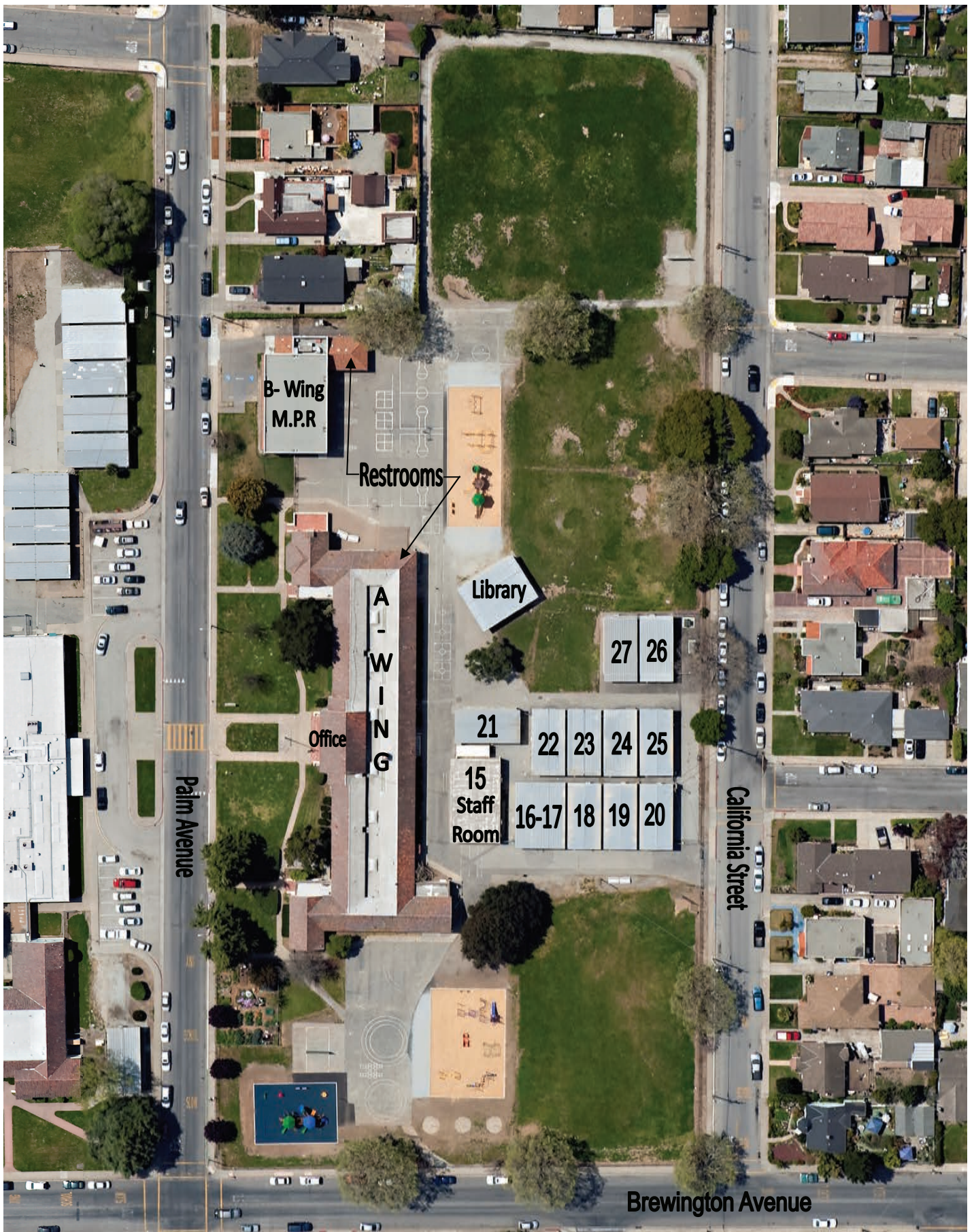
Mintie White Elementary School 515 Palm Avenue, Watsonville, CA 95076 Aerial Photo Taken 4/6/09