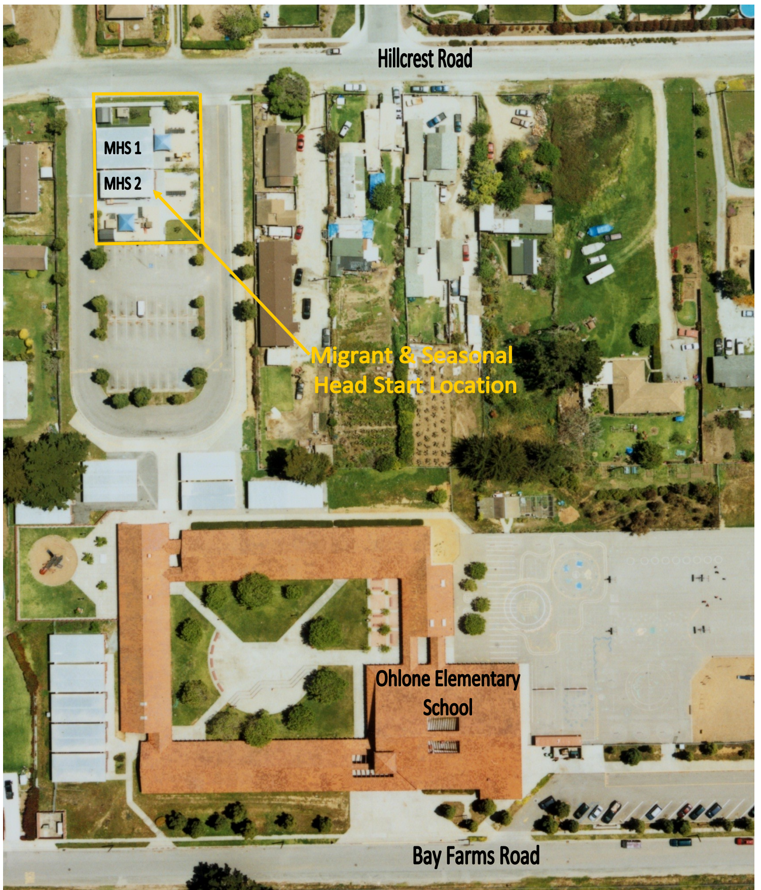
Ohlone Elementary School - Migrant & Seasonal Head Start Program 58 Hillcrest Road, Watsonville, CA 95076 Aerial Photo Taken 4/26/2003