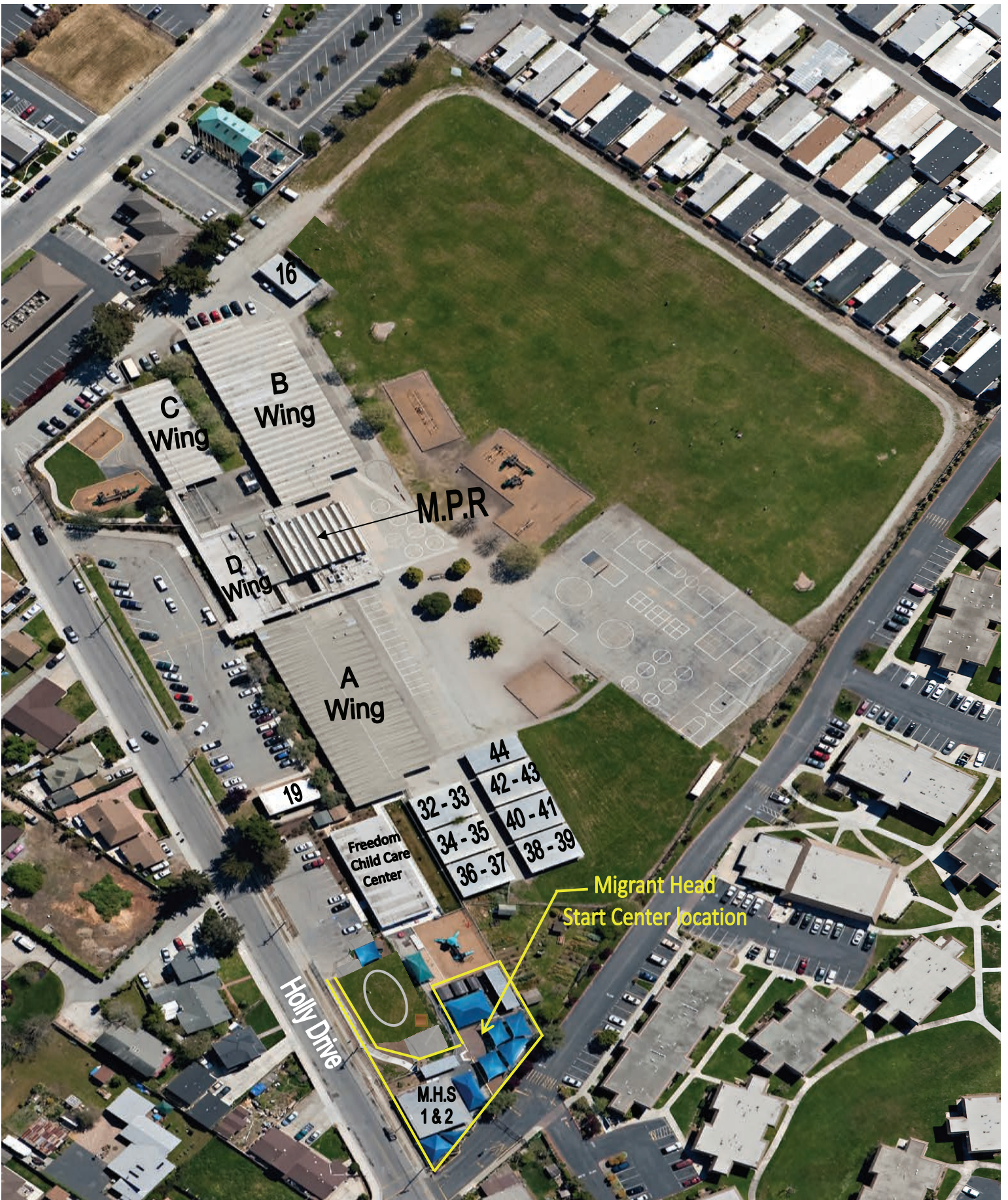
Freedom Elementary School - Migrant & Seasonal Head Start Center 25 Holly Drive, Freedom CA 95019 Aerial Photo Taken 4/6/09