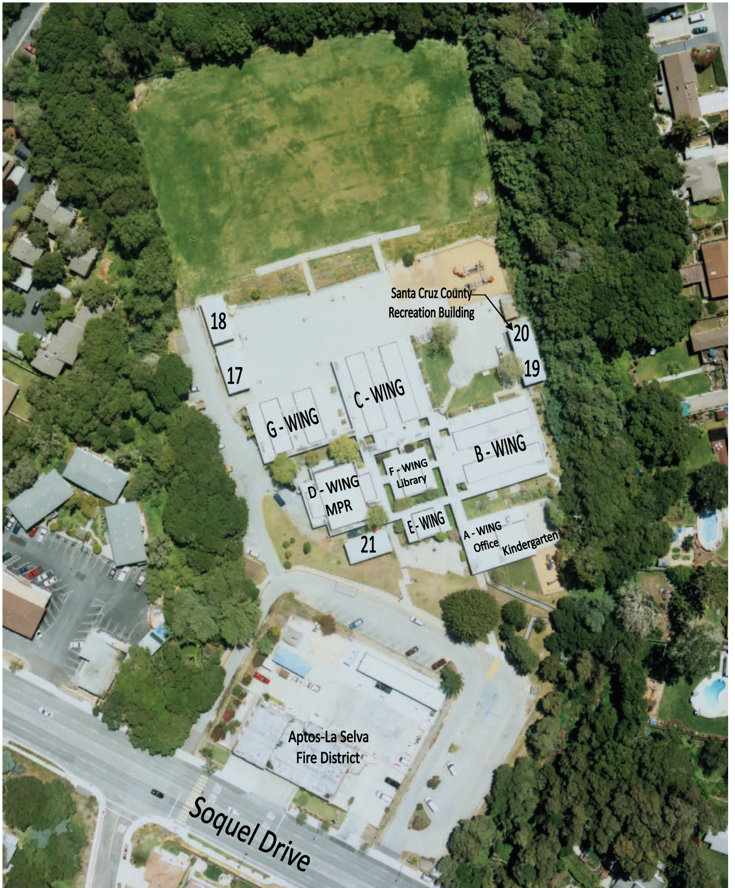
Mar Vista Elementary School 6860 Soquel Drive, Aptos, CA 95003 Aerial Photo Taken 4/26/03