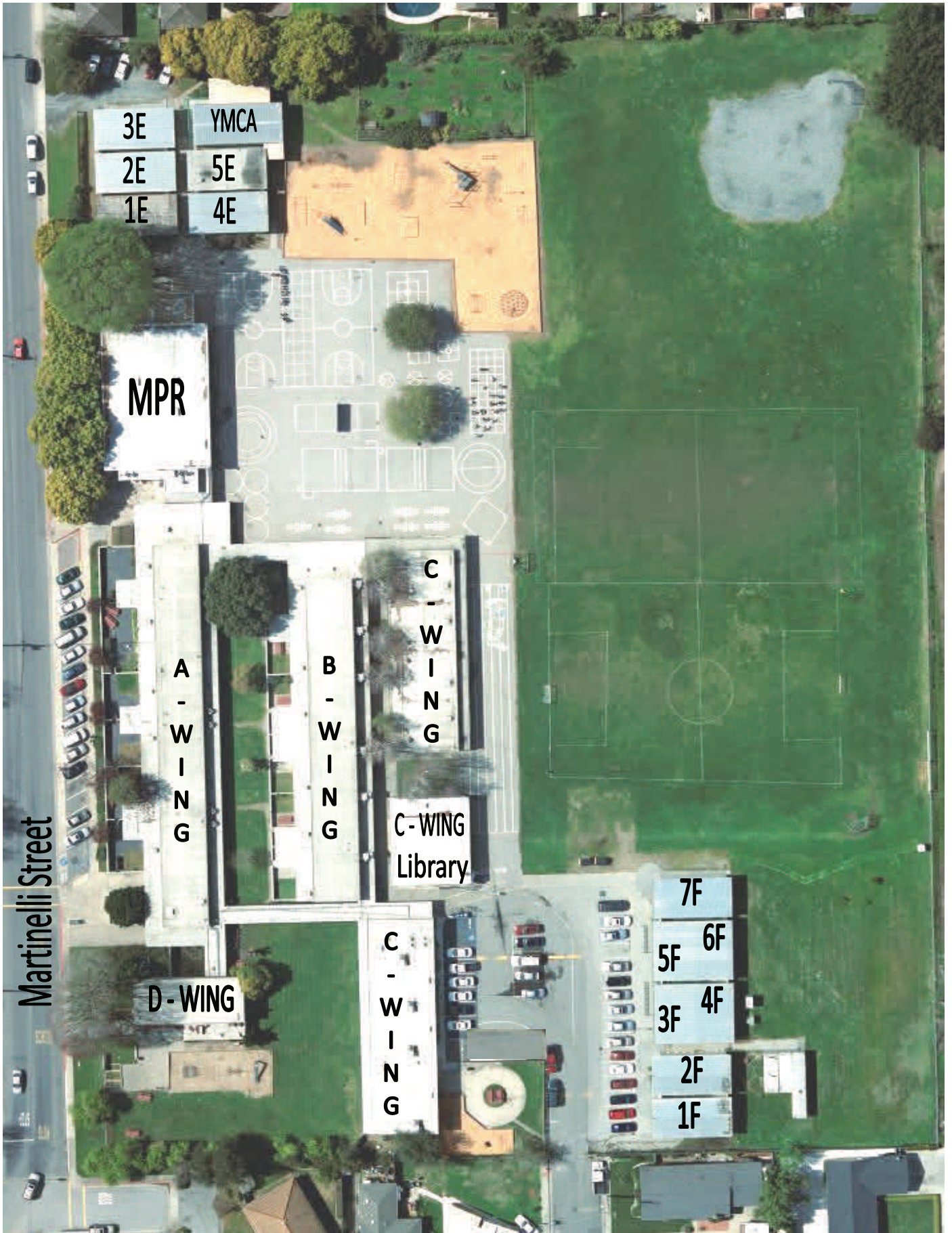
MacQuiddy Elementary School 330 Martinelli Street, Watsonville, CA 95076 Aerial Photo Taken 3/8/06