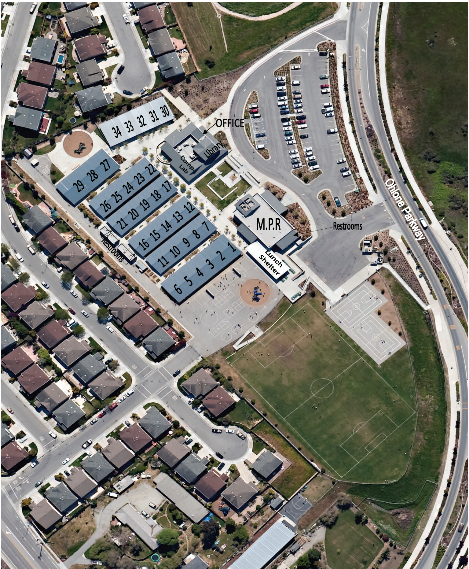
Landmark Elementary School 235 Ohlone Parkway, Watsonville, CA 95076 Aerial Photo Taken 4/6/09