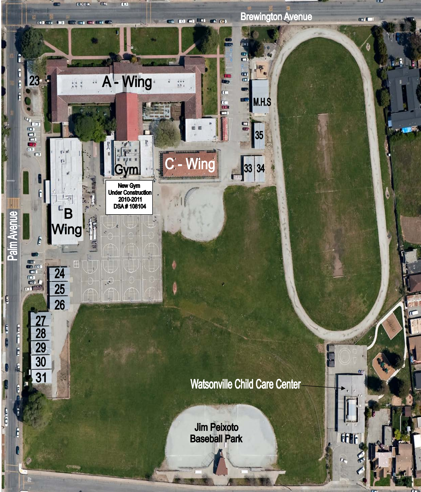
E. A Hall Middle School 201 Brewington Avenue, Watsonville, CA 95076 Aerial Photo Taken 4/6/09