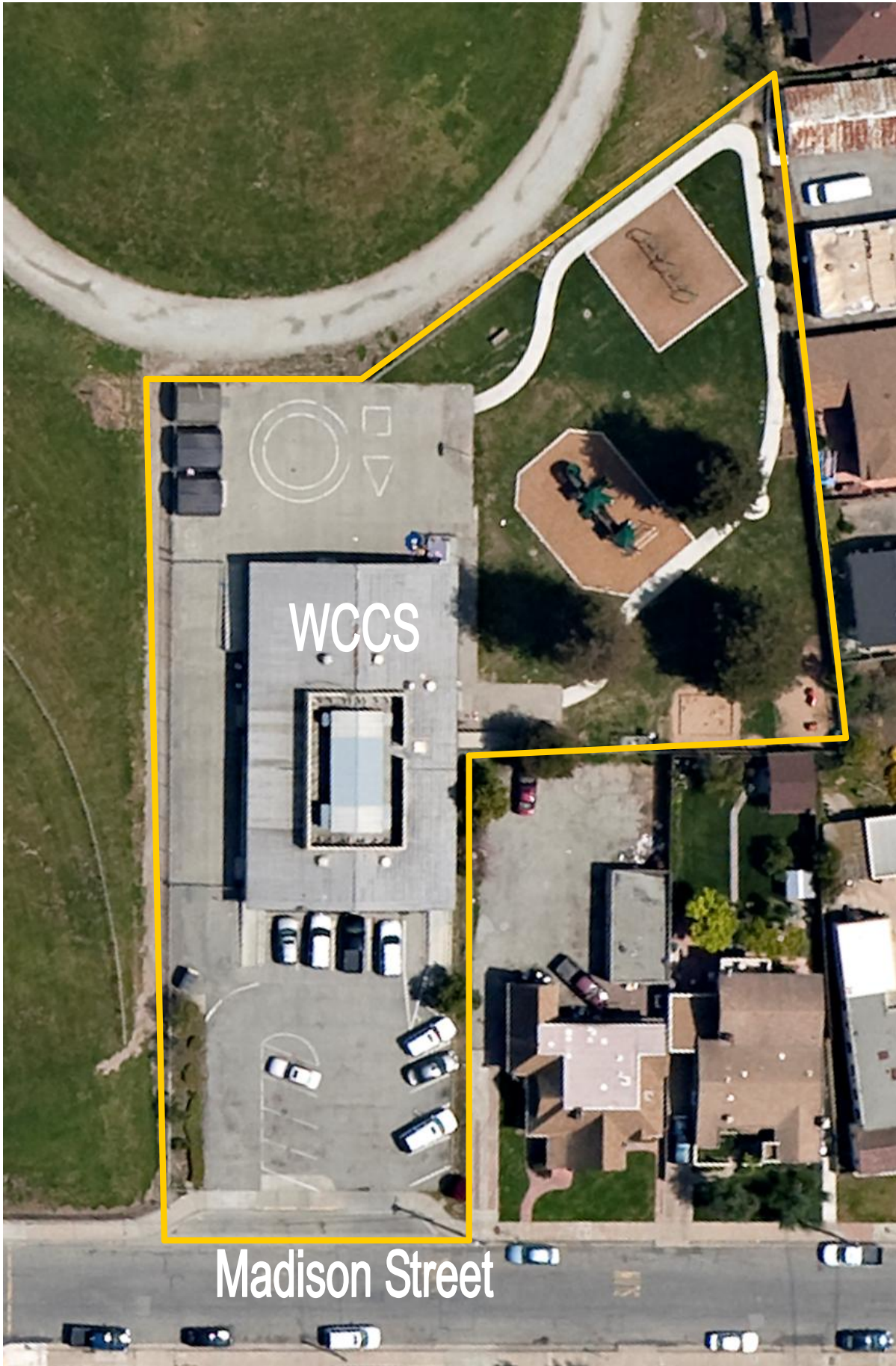
Watsonville Child Care Center 32 Madison Street, Watsonville, CA 95076 Aerial Photo Taken 4/6/09