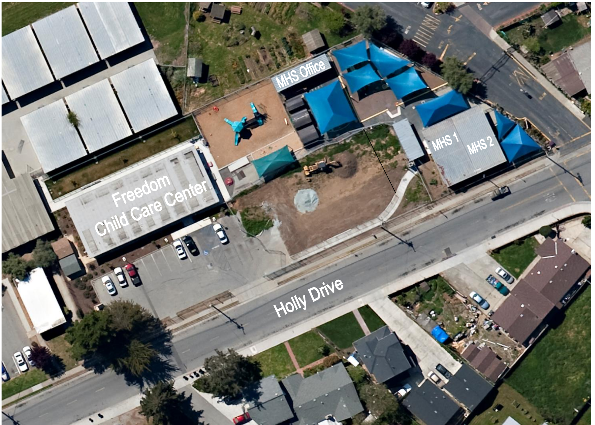
Freedom Child Care Center 25 Holly Drive, Watsonville, CA 95076 Aerial Photo Taken 4/6/09