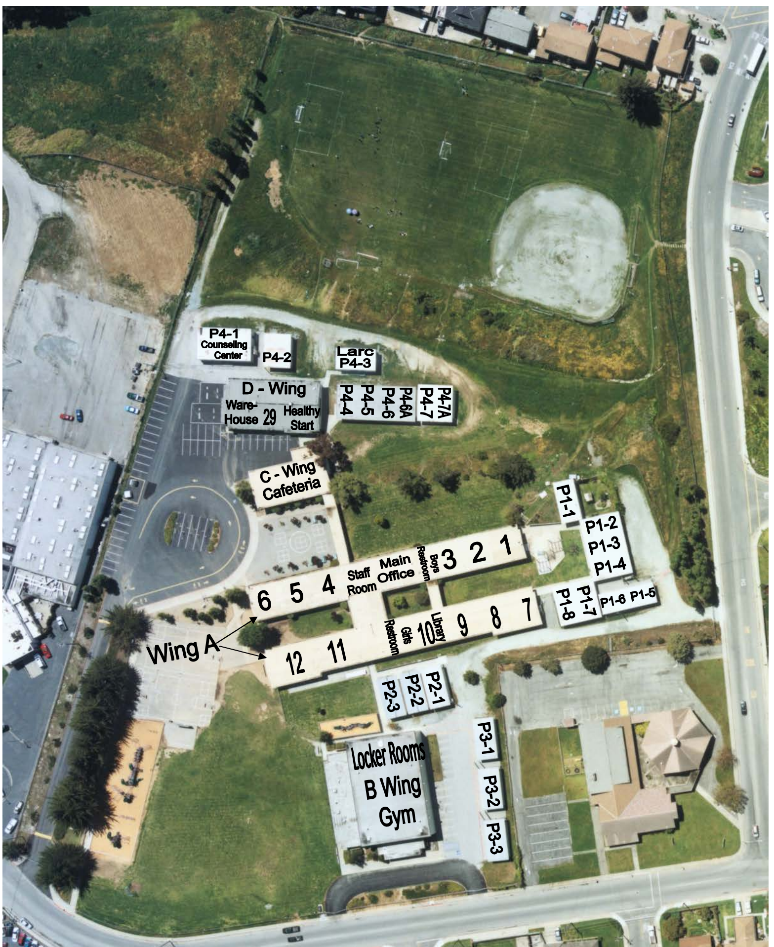
Cesar E. Chavez Middle School 440 Arthur Road, Watsonville, CA 95076 Aerial Photo Taken 4/26/2003