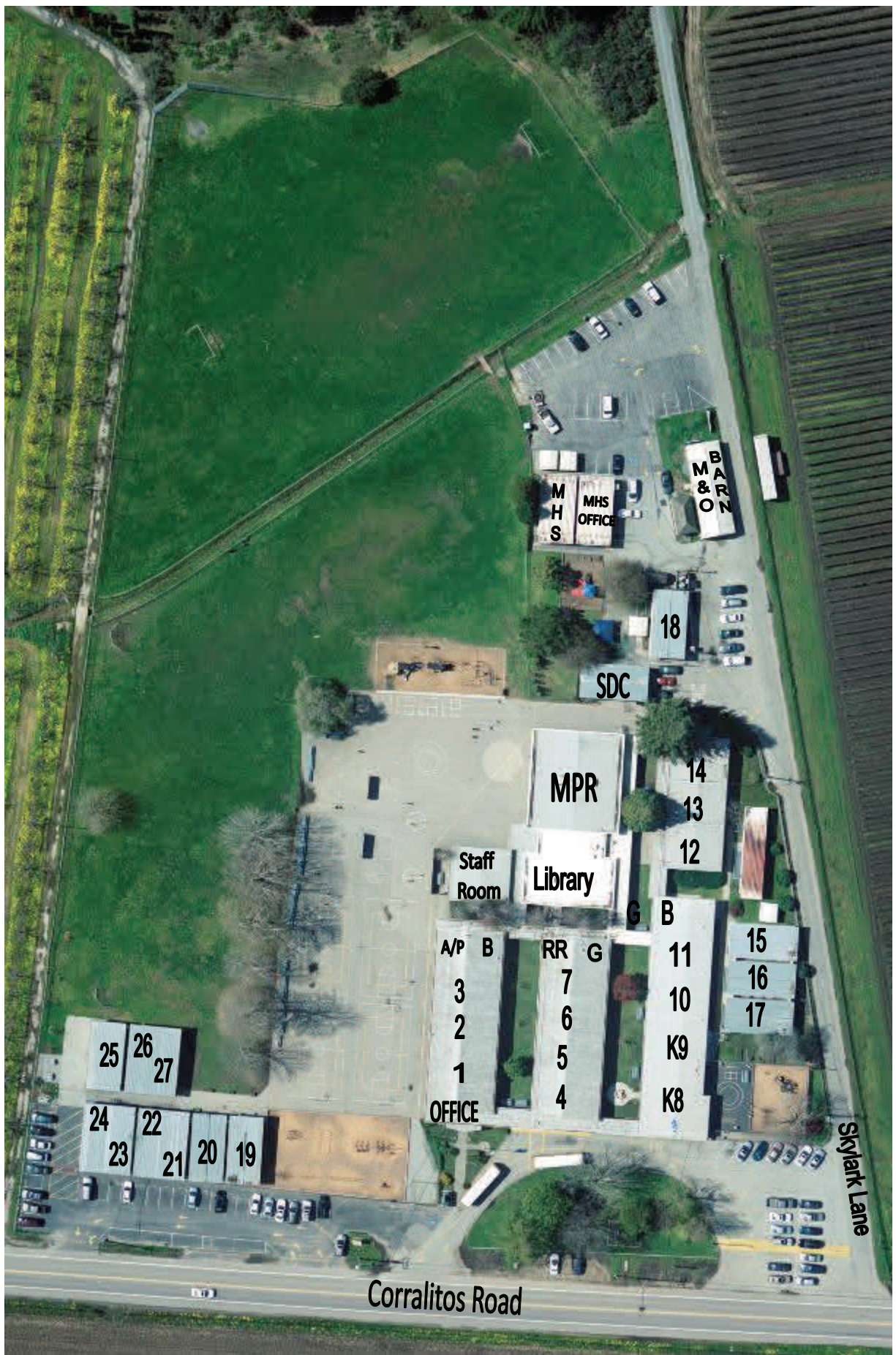
Bradley Elementary School 321 Corralitos Road, Watsonville, CA 95076 Aerial Photo Taken 3/8/06