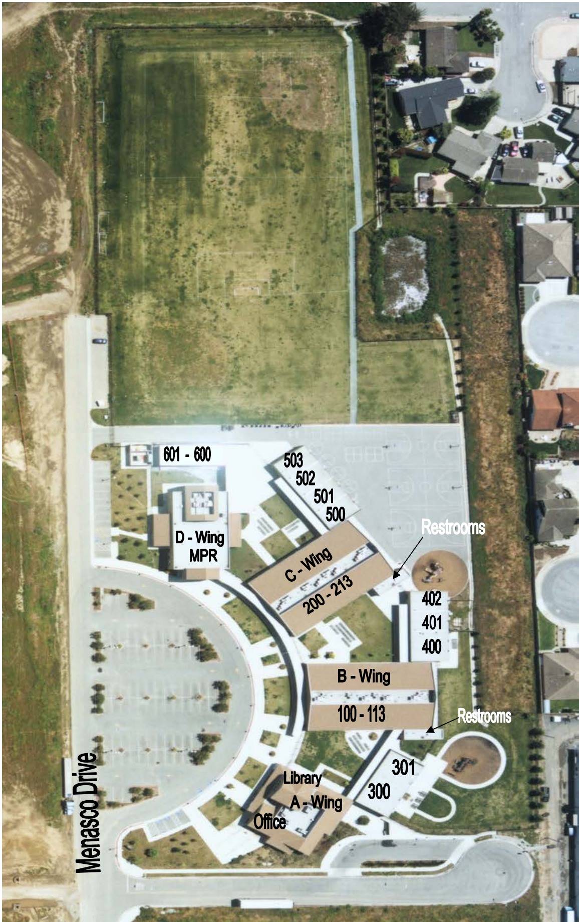
Ann Soldo Elementary School 1140 Menasco Drive, Watsonville, CA 95076 Photo Taken 4/26/2003